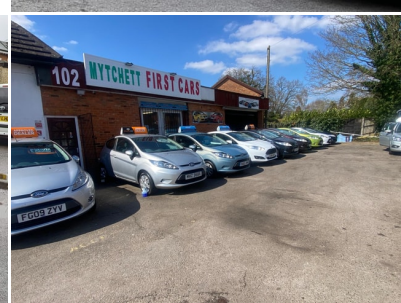
2010 Ford Fiesta 1.4 Titanium 3dr - Picture 6