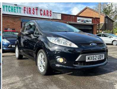
2012 Ford Fiesta 1.25 Zetec 3dr - Picture 7