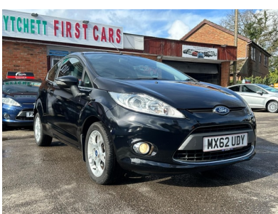
2012 Ford Fiesta 1.25 Zetec 3dr - Picture 7